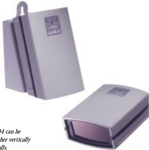
The LS 6804 can be mounted either vertically or horizontally.