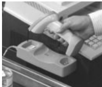
The LS 4071 communicates with the host via the cradle/base station.

The LS 4071 scanner from Symbol Technologies offers cableless scanning operation for greater flexibility, mobility and user friendliness. Ergonomically designed with the operator in mind, the LS 4071 also provides excellent scanning performance superior to competitive corded scanners. Plus, it's a member of Symbol's LS 4000 family of high-performance scanners.