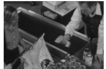
The LS 4071 lets operators scan items without lifting them for added speed and convenience – and no cable restrictions.

Today's first RF cordless scanner designed for retail and light industrial applications, the LS 4071 increases productivity at the check-out. Its award winning, advanced ergonomic design provides greater user comfort so the job is completed